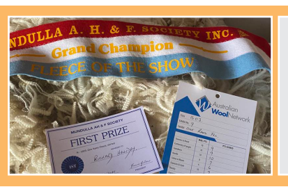
Callowie recently won Grand Champion Fleece at the 2023 Mundulla Show with a fleece from Callowie 20-0011.