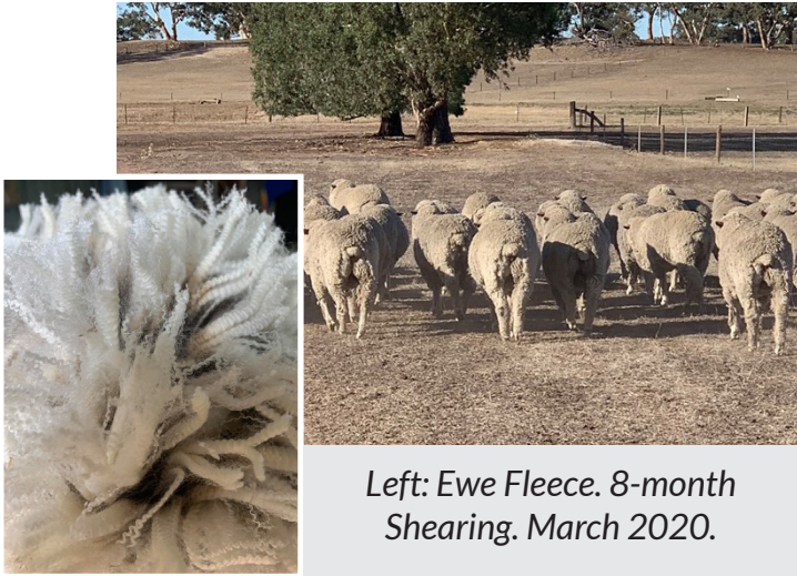
Left: Ewe Fleece. 8-month Shearing. March 2020.

Ewes are ready for lambing in May/June 2020.