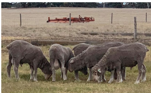
Above: 2020 Sale Rams

Look for them later in the year at our Annual Ram Sale.