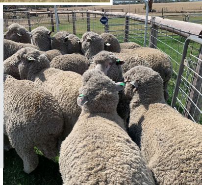
Right: 2020 Sale Rams Pre-Shearing, February